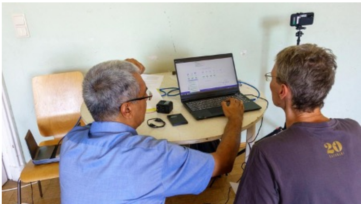
© Superar Slovakia – smART set-up training

While the children involved in our Music programs were enjoying their well-deserved holidays after a challenging academic year, we used the summer months for a technical introduction and training of the smART device in Vienna.